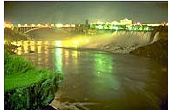
Niagara Falls at Night

The 2002 NYSFAAA Entertainment Committee has been feverishly working on ideas to make the 34 th annual conference a hit! The Queen city offers many attractions so the Committee is organizing a wide range of activities that will satisfy at least one of your tastes for fun! The Committee has come up with a variety of entertainment including live music, gambling opportunities, fortune telling, shopping excursions, art galleries, Buffalo's history, and a trip to Canada. The Committee is looking forward to packing in four fun-filled days for all participants attending the conference!