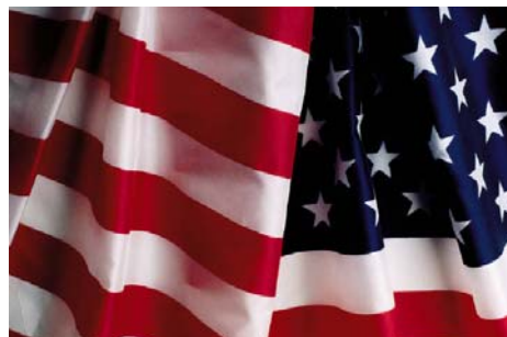
NYSFAAA has donated a total of $3000.00 to the American Red Cross WTC 9/11 Relief Fund. Thank you to Executive Council and the Regional Member ship.